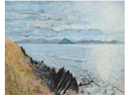
'Black Rocks, Cill Rialaig No. 1' by Pauline Bewick

At TPI there is a focus on the personal Integration of therapists.