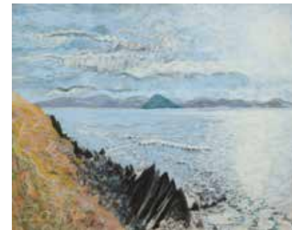
'Black Rocks, Cill Rialaig No. 1' by Pauline Bewick

At TPI there is a focus on the personal integration of therapists. The training therefore emphasises