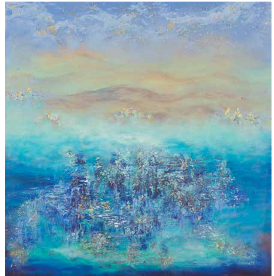
'A world dreamt into being' by Karen Ebbs

Assessment is based on attendance, course work and clinical requirements and includes written work and skills development. There is no formal written examination. Each student in training is considered as an individual on an individual journey. Students are assessed each year and progress from year to year only when they have met all the requirements to date, including the clinical requirements. An external examiner is involved in assessment for all years. An appeals procedure operates.