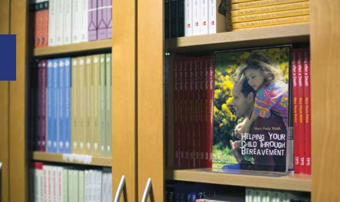
Turning Point Library

client for self-actualization. We also teach students the importance of acknowledging the transpersonal dimension, and how the meaning of events in a wider context can be turning points in the journey of transformation.