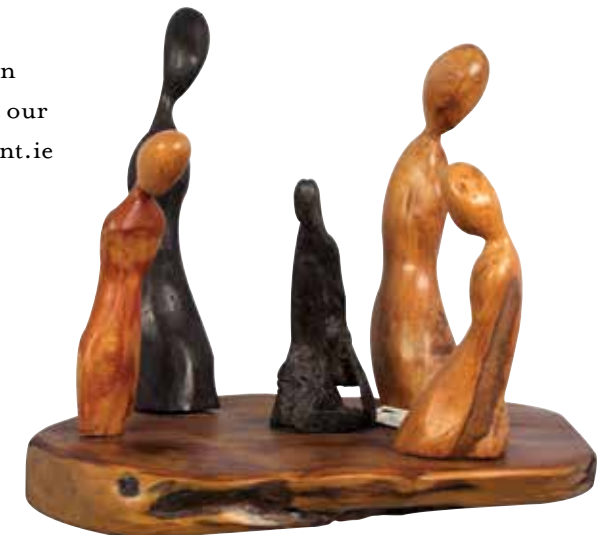
Oneness by Jim Hennelly

For updated information on all courses please see our website www.turningpoint.ie